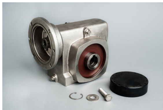
Ring, Bolt and Washer supplied for mounting to customer shaft. Seal Plug for protect of rotating output shaft.